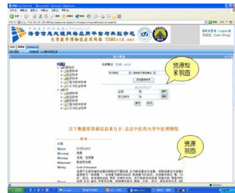
Figure 3. Semantic search service

In order to add a new museum resources to UDMGrid, the museum owners should use resource registration service to annotate their resources, the grid service developers need to modify the data access service to add new database, and the portal developers need to modify the portlet service corresponding to data access service in grid service layer, and there is no need to modify any other modules. The application service in UDMGrid such as semantic browsing service and semantic search service has considered different users' knowledge levels and motivation, providing good usability.