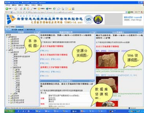
Figure 2. Semantic browsing service

Adopting the multilayer portal model for information grid, we have designed and implemented the portal of UDMGrid, as shown in Figure 2, Figure 3.