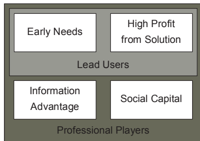
Figure 1: Illustration of the professional player traits

Figure 1 concludes the four traits of professional players in a diagram.