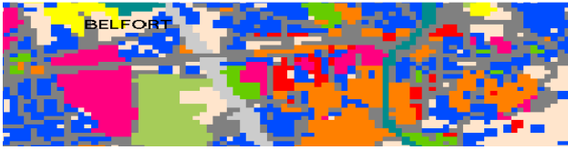
Figure 2. Ground Classification view mode of a part of the city of Belfort (each color corresponds to a class)