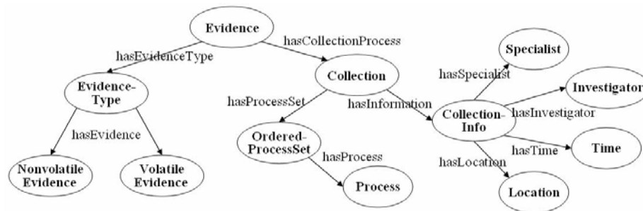
Fig. 2. Subclasses and Relations among Evidence and Collection of process

Evidence. The 'Evidence' class is a collection of processes and evidence types, and has subclasses 'Collection' and 'EvidenceType'. Evidence type has subclasses 'Nonvolatile Evidence' and 'Volatile Evidence'. Nonvolatile evidence includes H/W; computer, scanner, Disk, CD, memory stick, and others, and S/W; illegal S/W, application program, hacking tool et al. Volatile evidence includes memory dump, CPU log, routing history, Disk imaging and blog board et al. Cyber evidence is a compendium of data and history in the cyber space and digital equipments (parts).