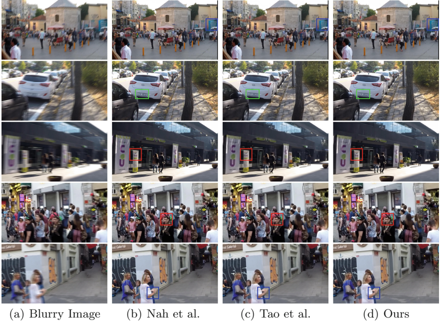
Fig. 2. Visual comparison on the dataset of GoPro dataset

the decoder is composed of a deconvolutional layer and three residual blocks. Different from [10,11] network structure, our network has two branches in the decoder part to recover the image content and the remaining information of the image respectively. In order to guide the two branches of the network to recover the corresponding image information, we use the connection between the feature maps to achieve the goal. The up part of the decoder inherits the feature map of the encoder, so the main image content is obtained first. The lower part of the decoder has no feature map skip connection, so the remaining image information is restored from blank image. Finally, we add results from two parts network can get the clear image.