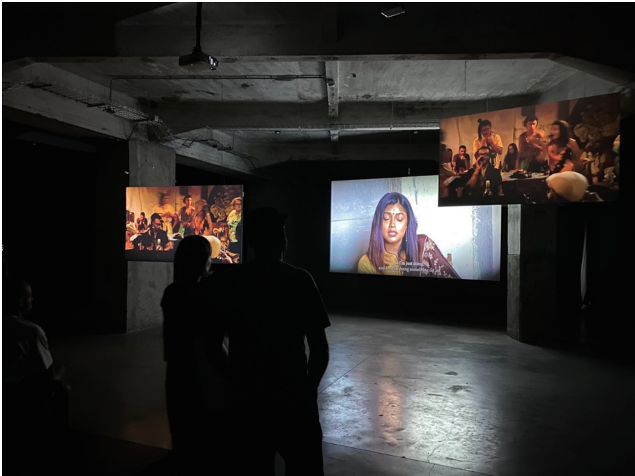
Fig. 1. View of installation at Carpentarias de São Lázaro

control of the documentarian and allow the voices of the subjects interact with each other in a free fashion. Meaning was created by how various clips interact with each other, how they reinforced or contradicted each other. The interview clips were projected on a larger middle screen while clips of the area and the montages were shown on the side screens. Again, these images were randomly displayed. The screens were at varying heights and distances from the viewer (see Fig. 1). Images from each of the screens were creating and recreating context through this randomisation process. The visual hierarchy of traditional cinema was removed as much as possible. Viewers could walk around the space or just sit on benches provided. The sound was primarily from the interviews, but the sound of the other clips also played at a lower volume to help create a sense of ambience.