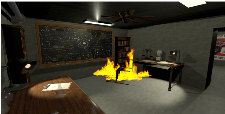
Fig. 3. Recipient's view in prototype

The Authors on the other hand, mainly classified the events as constituent events (65%), i.e. affecting the understanding of the story, and thus in effect, changing the story as the events were deployed.