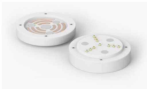
Fig. 3. The male-female connector to carry the signals to the electronic device

The EMG sensors have been made of conductive fabric based on silver yarn, laser cut and applied to the textile structure through thermo-adhesive. The myoelectric signal is carried by the sensors to the terminal base of the liner by conductive filaments that are inserted inside metal probes. These probes, three for each of the two EMG sensors, are mechanically inserted and welded inside a male connector, made of polymeric material, on which a connection plate is inserted. The male connector is inserted in the female connector through a system of magnets which allows to stabilize the contact between the parts (Fig. 3).