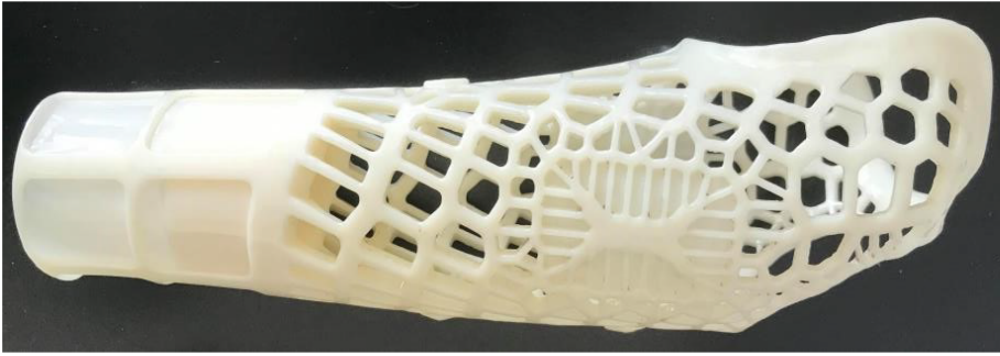
Fig. 1. The Hypermat meta-structure, designed by CNR ICMATE.