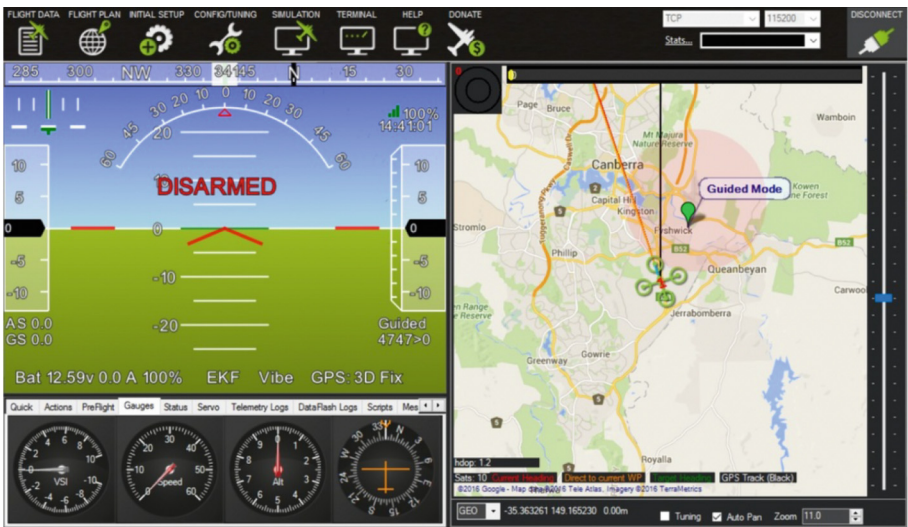
Fig. 3. The GUI of the Dronekit project [5]

Furthermore, DroneKit-Python is not limited to onboard applications alone; it also serves ground station applications. In this capacity, it enables communication with vehicles through a higher latency RF-link. This dual capability ensures a comprehensive and versatile toolkit for developers to innovate and create tailored solutions that suit both onboard and ground station requirements, ultimately advancing the realm of UAV technology. Figure 3 presents the GUI of the Dronekit project.