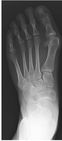
Fig. 5. X-ray images of patients

Figure 5 shows the patient’s bone and joint clearly, and Figs. 4 and 5 prove that the mobile phone intelligent display system designed in this paper can meet the display of remote consultation information. The comparison results of power consumption between this system and traditional system in displaying the same sample information are shown in Table 1.