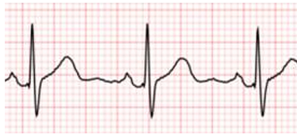
Fig. 4. Patient ECG image

In the experiment, the patient's relevant diagnostic information is sent remotely and sent to the intelligent display system on the mobile phone, and the corresponding image is obtained. Figure 4 shows the ECG image of the patient obtained in this system.