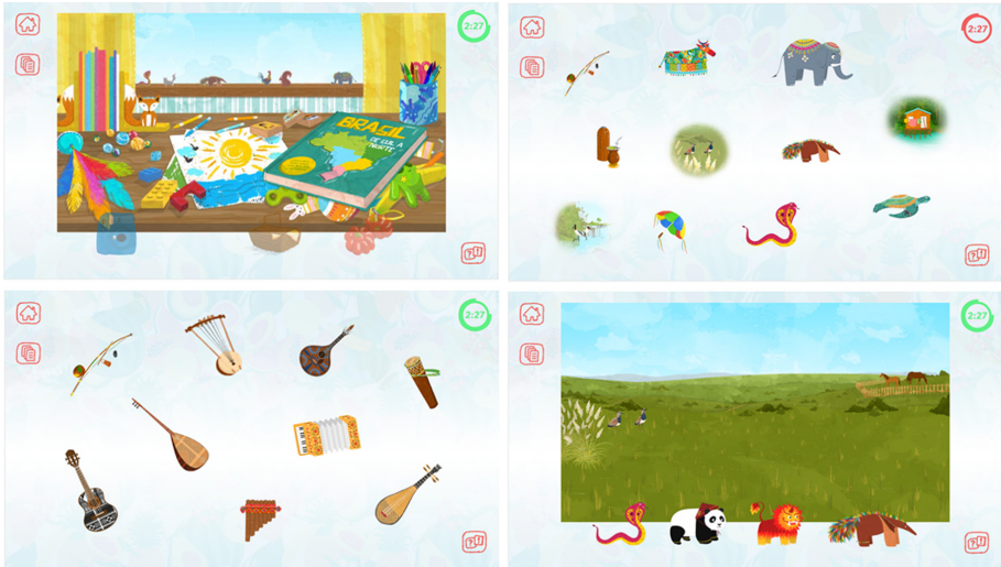
Fig. 2. Initial designs for the some of the game level's: (I) identifying objects related to the story (top-left), (II) discovering the story element (top-right), (III) pairing sound and object (bottom-left), and (IV) matching animals and their habitats (bottom-right)

end of each level. Depending on the users' performance, there will be different kinds of feedback, such as instructions that highlight the semiotic resources used during the meaning-making process, as well as hints that emphasize the relations between each mode, which will be presented during the different challenges in each level. Little tips of extra knowledge will be offered for the users that solve the game. smartphone