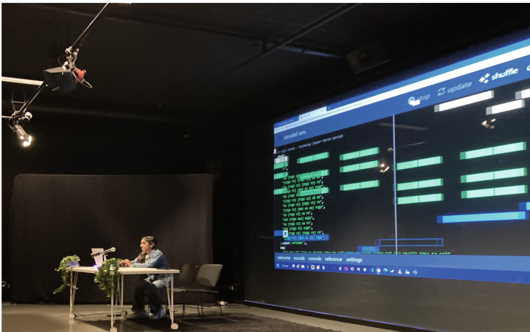
Fig. 4. Performing on stage - Live Coding in Strudel

In conclusion, through the careful and detailed implementation of Braun and Clarke's (2006) six-phase framework [6], we managed to reveal crucial insights into the girls' experience with Creative Coding sessions. The identified themes and sub-themes highlighted the girls' enthusiasm, learning, collaboration, mentoring, inclusivity, iterative and creative process, and final performance.