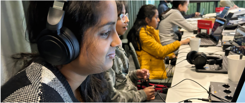
Fig. 2. Participants coding music

which facilitated their comprehension of the coding principles in Strudel. The participants exhibited an aptitude for understanding and applying the coding concepts conveyed during the sessions, thus attesting to their progress along the learning continuum. They were able to establish logical connections between the musical notes and the corresponding codes, which is indicative of their progress in their learning journey. Participants coding their own music pieces can be observed in Fig. 2.