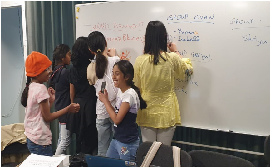
Fig. 3. Participants creating groups

Planning for solo, duo, and trio acts provided girls with the opportunity to take on different roles, promoting personal growth and skill development. It was admirable to see the girls taking the initiative to do a solo, duo, and trio. The participants were given the freedom to choose their partners for the performance and this gave them the freedom to explore and communicate further with their team members. Participants actively selecting their partners for their performance is observable in 3.