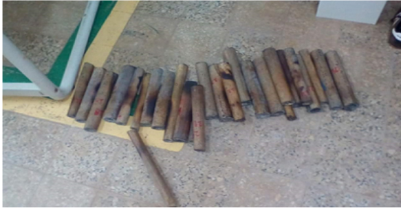
Fig. 2. Bamboo samples at different parameters combinations