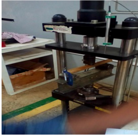
Fig. 1. Universal testing machine

carried out making use of Taguchi’s design of experiment due to its small number of experiments to execute.