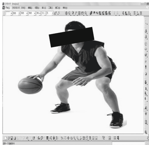
Fig. 2. Image of basketball dribble

The captured images are shown below (Fig. 2):