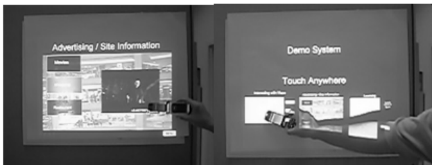
Figure 6. NFC Interactive Panel in action.

In figure 3, some examples of the interaction are show. For some demo videos can be found in [4].