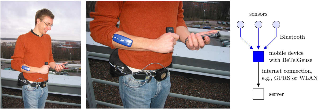
Figure 1: Using BeTelGeuse. Our subject carries a PDA device which runs BeTelGeuse. BeTelGeuse gathers data from the following Bluetooth devices: a GPS device (in the right hand), Alive Heart Monitor (attached to the right arm) and I-CubeX sensor system (on the waist, from left to right: the controller and an orientation sensor in the bag; a 3D acceleration sensor, an ambient light sensor, a temperature and humidity sensor, and an ultrasound distance sensor attached to the belt). See Table 1 for more information on the sensors.