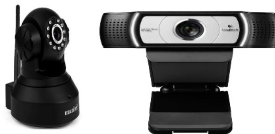
Figure 2: System setup with different cameras

A Sitecom N300 modem for use with the Asus VivoMini and the IpCamera over Wi-Fi.