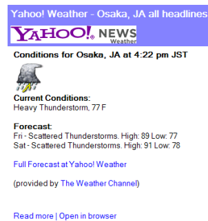
Figure 3: The extracted weather information from the URL, which is shown in RssReader.

dangerous if the postoperative wound is exposed to the rain, which may cause serious infection. However, with a smart phone that can automatically check the weather information online, these patients can be informed about the coming storm at least 15-20 minutes in advance, which allows them to have enough time to find the right places to avoid the exposing to the rain.