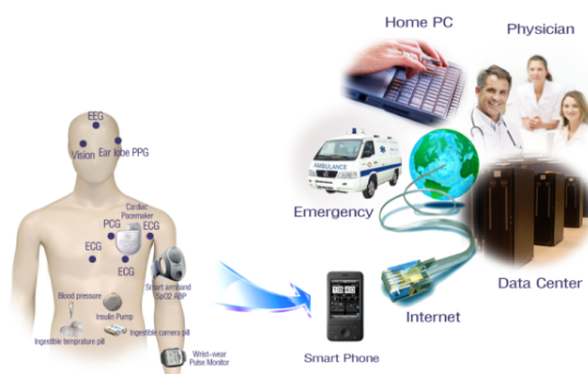
Figure 1: The system model of body sensor networks proposed by the Integrated Microsystems Enterprise (IME) in College of Engineering at Michigan Technological University, USA.

BodyNets '11 , Beijing, China, 7-8 November 2011, ISBN (978-1-936968-29-9)