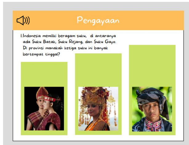
Fig. 10. Examples of displaying reading comprehension and enrichment activities in Malin Kundang's story which has been developed into a graphic novel.

The picture above is an example of a graphic novel that was developed from the story of Malin Kundang in the BIPA enrichment book. Narratives can be placed above or below the panel to explain the background to the story and for conversations to be placed in a conversation bubble. With a reading format like this, the process of learning Indonesian will be more interesting and easier to understand. The reader will directly witness the expressions, expressions, and background of the story.