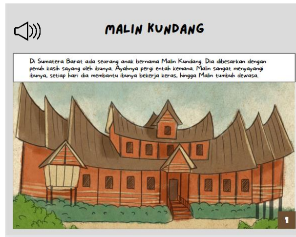
Fig. 5. Examples of how Malin Kundang's story has been developed into a graphic novel.

Expanding the visual mode in the enrichment book is the most important development in the concept of this article. The next step is to make image illustrations according to the storyline, made in the form of panels containing narration and conversation bubbles. It is necessary to pay attention to the selection of colors and fonts used. Each title of the story in the book is made in graphic novel format.