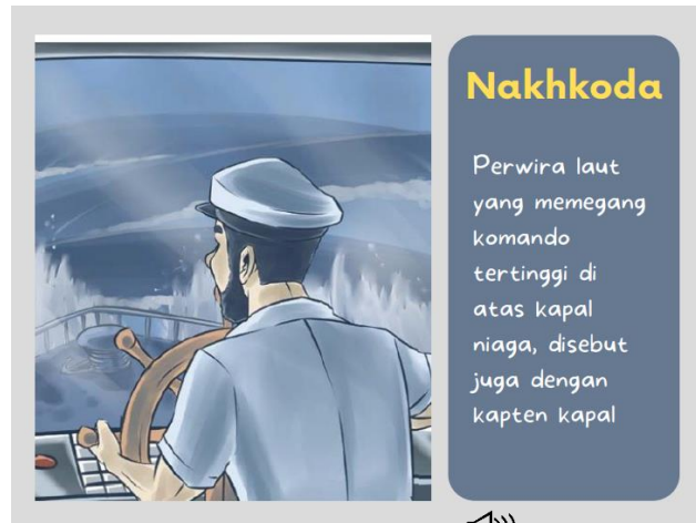
Fig. 7. An example of the display of Key Vocabulary in the Malin Kundang story which has been developed into a graphic novel.