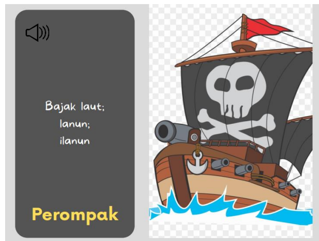
Fig. 8. An example of the display of Key Vocabulary in the Malin Kundang story which has been developed into a graphic novel.