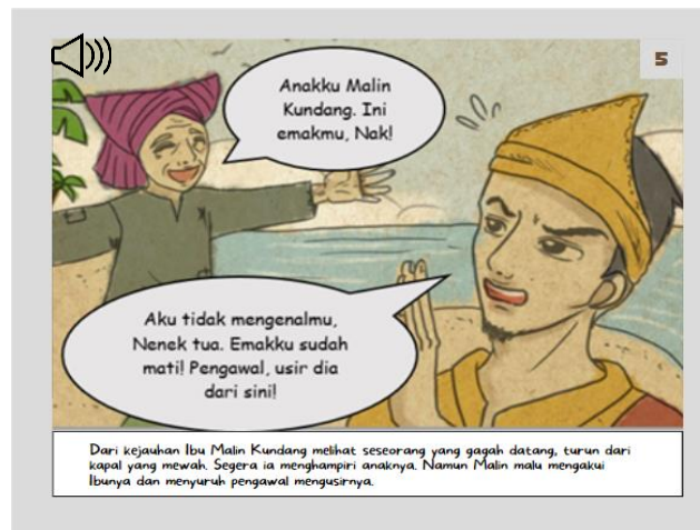
Fig. 6. Examples of how Malin Kundang's story has been developed into a graphic novel.