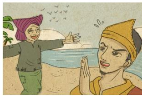
Fig. 1. Malin Kundang's story in the BIPA enrichment book My Friends Indonesia Book 7

rajin dan bekerja keras, dalam waktu yang tidak lama, ia berhasil menjalankan perniagaan sendiri. Beberapa tahun kemudian, Malin Kundang sudah mempunyai kapal yang menjalankan perdagangan antarpulau. Kini, pemuda itu sudah menjadi saudagar kaya. Ia lalu mempersunting seorang gadis, putri tunggal saudagar kaya. Maka bertambah keralah Malin Kundang. Saudagar kaya Malin Kundang! Begitulah orang-orang menyebutnya. Berita itu menyebar sampai ke pulau-pulau di sekitarnya. Termasuklah ke pulau tempat tinggalnya dulu. Ibu Malin Kundang juga mendengar berita itu. Ia bersyukur. Besar keinginannya untuk melihat, sudah seperti apakah kini anaknya. Hampir setiap hari ia datang ke dermaga, sambil berharap ada sebuah kapal datang yang membawa anaknya pulang. Suatu hari, Malin Kundang bersama istrinya melakukan pelayaran. Kapalnya dihias begitu indah. Untuk menjaga dari serangan para lautan, ia membawa para pengawal dan awak kapal. Begitu melihat sebuah kapal dengan hiasan sangat indah berlabuh di dermaga, ibu Malin Kundang merasa yakin, itulah kapal anaknya. Dari kejauhan, tampak seorang lelaki gagah melangkah meninggalkan geladak. Di sampingnya, berjalan seorang perempuan cantik. Ah, tak salah lagi, itulah anakku, Malin Kundang, begitulah si ibu berkeyakinan. Malin Kundang berjalan di dermaga. Di kirikanannya, para pengawal mengiringi. Demi melihat Malin, serta-merta, si ibu berlari ke arah anaknya itu.