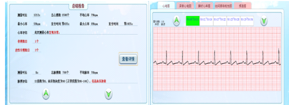
Fig.4 ECG Analysis Result

In addition, the tendencies of the extracted features, which are important to evaluate one's health condition, are analyzed through long-term record. The user can clearly see the change of his indicator through the tendency image.