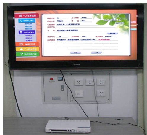
Fig. 5 The display effect of ECG on TV

There are different kinds of interfaces for the user to view his historical record and the corresponding analysis results through the physiological data. For example, one can visit the health management platform, or through the TV section, as well as, he can get the analysis result and by message. The display effect on TV is shown in Fig.5.