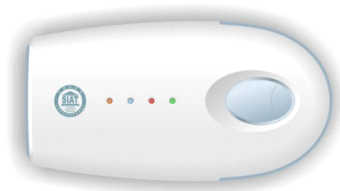
Fig. 2 Body sensor for ECG

Fig.2 presents a typical body sensor for ECG acquisition. The body sensor can monitor the ECG signal conveniently without electrodes, and then send the data to mobile phone via Bluetooth for further analysis.