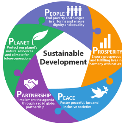
Fig. 1. Sustainable Development

intended to be achieved by 2030, known as 2030 Agenda. 17 Sustainable Development Goals are shown in figure 2 [1].