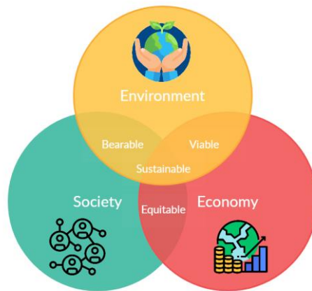
Fig. 3. Three Pillars of Sustainable Development

We need to give due importance to sustainable development as environmental deterioration is ubiquitous and growing in our world. We all know that global warming is the most serious of the major environmental concerns. With the help of technological innovations, we have to ensure that these concerns get resolved, such as the use of EVs to promote zero-emission and achieve climate action goals. Sustainable development ensures prosperity and allows us to be efficient overall by utilizing the available resources.