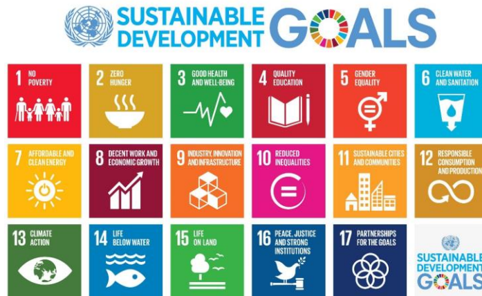
Fig. 2. Sustainable Development Goals.

The rest of the paper is categorized as in Section 2 need and importance of sustainable development is discussed. In Section 3, use of ICT for Sustainable Development is presented. In Section 4, current global status of SDGs is presented. In Section 5, application domains for sustainable development were discussed. In Section 6, methods to achieve sustainable development in different application domains (SDGs) are presented and lastly in Section 7, conclusion of the paper is done.