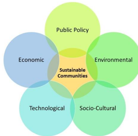
Fig. 5. Application Domains of Sustainable Development

all across the world are dealing with the devastating human and economic consequences of the COVID-19 pandemic. As the globe prepares to return to normalcy following the pandemic, an opportunity for an economic and national recovery plan develops. Sustainable Development should aim to revitalise activities aimed at reducing average global warming to 1.5 degrees Celsius by exponentially scaling up worldwide efforts [12].