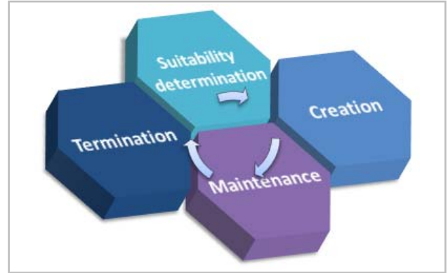
Figure 2. Opportunistic network phases.

algorithmic solutions. The overall dynamic operation of the ON will be based on a comprehensive solution ensuring the integration and synergic operation among the different algorithms. For example, in the maintenance stage, the identification of spectrum opportunities functionality can dynamically monitor the status of diverse license and un-licensed bands in order to feed the spectrum selection decision-making process with updated information. In turn, the spectrum selection algorithm may decide e.g. a reconfiguration of the ON by executing a spectrum handover to a more suitable spectrum piece.