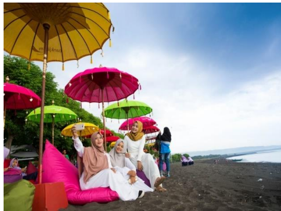
Fig. 2. Santen's Island

This beach tourism destination, which is branded as halal tourism, was opened on March 2, 2017, as Santen Island's Sharia Beach. Halal tourism on Santen Island's Sharia Beach prioritizes things that are Islamic, from cleanliness, ethics, and manners to the culinary product sold [15].