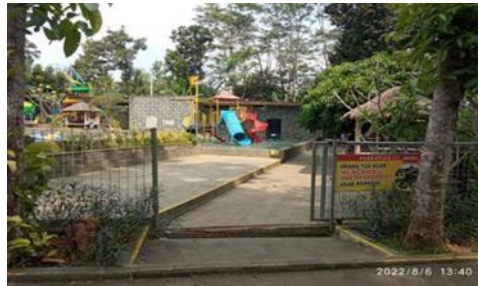
Fig. 3. Trisobo Park Swimming Pool

outside the village but at the closest districts of Semarang city, mainly at Mijen and Ngaliyan districts, in which they experienced face development in the areas of factories, industrial estate, city level offices, national level institution for inmate correction complex, universities, malls, and many residential estates