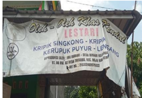
Fig. 4. Cassava chips production place

The existence of the park and visitor entering the village did not increase their income. Their market segment was formed outside their village, for example ibu Rubiyah products filled the Boja and Kaliwungu market, ibu Tiwi products were sent to Semarang, pak Supriyanto had his product sold further to Salatiga, Magelang, Temanggung, Wonosobo, and to Demak at the east. Cafes and food stalls grew along street after the village gateways and it served the local people and the passerby needs. An important fact found in Trisobo was that the existence of Recreation Park did not have relation to the growth of new small business in the village. It could be experienced by other villages which hold position as tourism village/CBT. The tourism theories which state that tourist attraction will induce business development linkage, backward or forward, to the surrounding area, in reality did not work in Trisobo village. Apart of the possible failure of the attraction, there were other factors to grow tourism or business related to tourism industries in Trisobo, namely: people awareness and their motivation to involve in the activities.