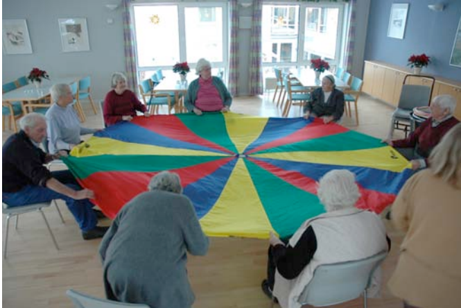
Figure 1. Exercise at Bjerggaarden. One of the week's high points.

The nursing home is kept in light colors, the atmosphere seems friendly and many walls are decorated with a variety of art. The elderly inhabitants individually points out that Bjerggaarden has a good reputation and that the surroundings are above standard.