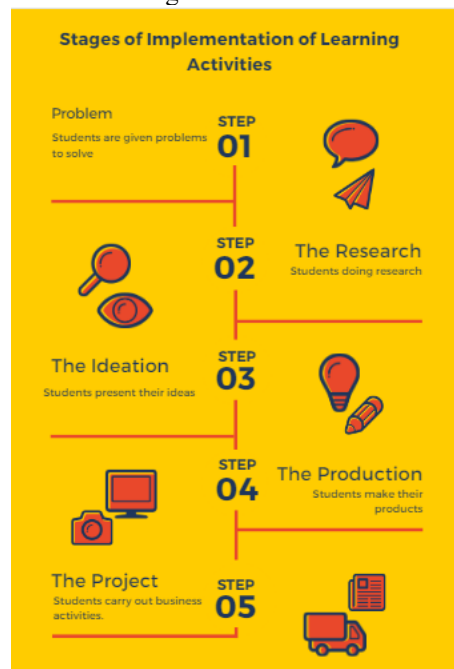
Figure 2: Activity stages

This research takes a qualitative approach to learning through participatory entrepreneurship. In this study, a case study was used to get a complete case description, an analysis of the theme or subject matter, and the researcher's interpretation or confirmation of the case. The researcher hopes to expose and evaluate extensive data about participatory learning in the implementation of entrepreneurial courses through this case study. As sources of triangulation data that can be accounted for accuracy, this study used observation, in-depth interviews, and documentation analysis as data collection techniques. Three steps are employed in data collection: (a) orientation to gather information about what is important to find, (b) exploration to determine something specific, and (c) member check to verify findings and obtain a final report according to processes. The following are the stages of this investigation: