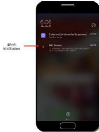
Figure 4. Air pollution notification from blynk apps

air quality at the time the test was carried out was at a moderately polluted level so that notifications were sent to the user's smartphone via the Blynk application..