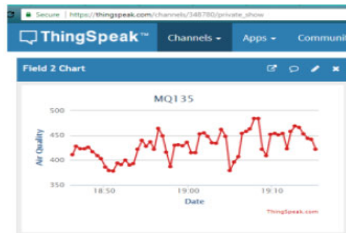
Figure 3. Monitoring graph on thingspeak server server

It is shown in the figure, which is evidence from the thingspeak report, that each listed point is a real-time detected value, with PPM [10];[11]. The test scenario carried out is to activate a component, and place it in the room. The next process is to observe the values displayed on the IoT platform on the Thingspeak server. Analog values are recorded from the server, which are taken randomly over a certain period of time [12];[10]. Based on log data from server testing with a monitoring time of about 20 minutes, a report will be obtained from the digital graphics server, that the MQ-135 analog sensor value is in the range of 356 to 531.