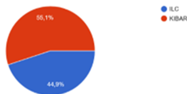
Figure 2. The number of students of ILC and KIBAR (Foreign Language Development Program)

69 students who joined Islamic Institute English Club (ILC) and (KIBAR) as Language Foreign Development Program at Ma'had Al Jamiah in IAI DDI Polewali Mandar Regency, West Sulawesi, Indonesia. Purposive sampling used in this qualitative study. In total 31 students of ILC (3 male, 28 female) and 38 students of KIBAR (16 male, 22 female) age from 18 to 23 were involved. The questionnaire were spread by Google form that shared in Whatsapp Group. All the students had received feedback from their teacher during the Foreign Language Development Program both in ILC and KIBAR.