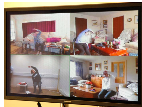
Figure 2. The optimum video screen layout was selected that displayed all the participants – in this instance, the physiotherapist appeared bottom left.

A videoconferencing service (JVCS Desktop) available to the JANET community was employed, which enables 12 users