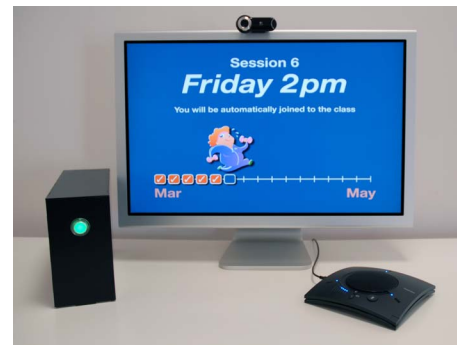
Figure 1. A custom designed PC was connected to each patient's home TV and wired to the Internet, together with a webcam, speakerphone, and where appropriate, a wireless pulse oximeter.

The design and implementation of a Norwegian pulmonary rehabilitation system, involving a dedicated PC running open