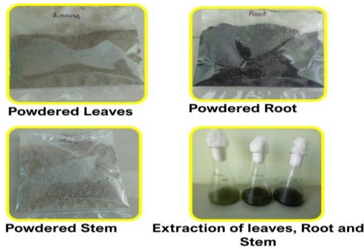
Figure 6. Water Hyacinth parts mixed with powder

Different particles of water hyacinths are mixed with powders to improve the working efficiency of the particles. It is also worked for liquid extraction from the water hyacinth for the purification purposes. The following figure 6 describes the powder mixed water hyacinth parts.