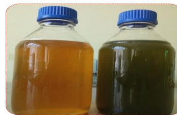
Figure 5. Industrial effluent taken at different places

Different places of industrial effluents have taken like from Salem and Namakkal districts of tamilnadu. It contains impurities and several heavy toxic component metals at a different color. The following figure 5 denotes the color and hue of the industrial effluents taken from the different places.