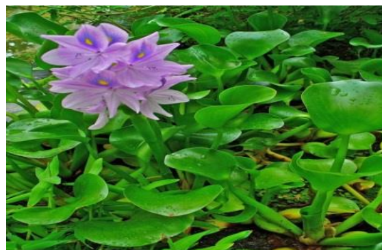
Figure 2. Water Hyacinth

The growing rate of water hyacinth is optimum level while the process of nutrition subtraction, purification on wastewater. Impurities and floating particles of the water can be absorbed by the roots of the water hyacinth. The soil, water, and air's normal contaminants are rendered by degradation of hyper accumulators using the bioaccumulation process of the plants naturally [21]. The phytoremediation concept is mainly used to concentrate on the purification of poisonous metals and organic pollutants. For environmental cleanup, and feasibility training of the plants have taken. Chemically and physically general treatments of the processes are clotting along with adsorption [22], [23]. The following figure 2 shows the water hyacinth grown in industrial waste water surfaces.