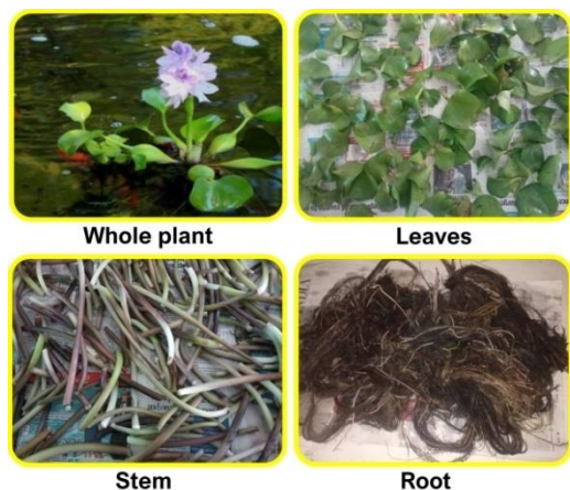
Figure 4. Eichhornia crassipes particles

Mettur Dam, Salem, Tamilnadu is the place where we have collected the raw materials with the latitude 11.786253, and the longitude is 77.800781. Their particles such as leaves, roots, and stem are detached in the plant is described in figure 4. It was kept in a separate room with a certain temperature level continuously for 7 to 9 days and some tiny particles were packed down with a kitchen mixer and acquired fine particles. It was kept in a bottle with an air lock for successive experimentation.