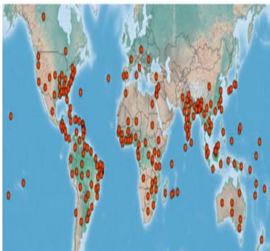
Figure 1. Global spread of water hyacinth on 2021

Water hyacinth scientifically called Eichhornia crassipes is generally grown in South America's subtropical and it's native too. Generally, the growth of the water hyacinth is a minimum of 40cm and a maximum of 1m in the water-filled areas [1-3]. The industrial effluent particles are connected with the water places such as lakes, ponds, rivers, and pits. To control the effluent addition in water is the most complicated task in the polluted environment due to its scattered nature and spread in nearby places too. Various techniques are used to handle these effluents such as chemicals added to these particles, removed manually; machines used, and so on, which have not given complete solutions for industrial effluent handling [4-6]. Later, the Phytoremediation method has introduced to handle the problems in industrial effluent. It looks with purple and black color feathery has a root and pink, lavender color six petals are visible at their growth of 8 to 15 days [7-9]. Water hyacinth plants are produced 1000 seeds per year due to their growing nature. The sustainability of the water hyacinth is more than 28 years once it starts growing. It grows 2 and 5 meters generally in a day in South Asia side countries [10-13]. Normally, water hyacinths are vigorous and the size is growing double. As per the records of the Centre for Agriculture and Bioscience International website the global spread of water hyacinth all over the world is shown in the following figure 1.