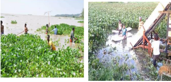
Figure 3. Water hyacinth managed methods