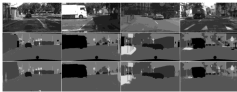
Figure 2. Segmentation result(from top to bottom, Input image, marked true value, predicted value)

As can be seen from the results in Table 2, compared with the method of directly integrating feature maps at different levels, the segmentation accuracy of the front-end+Large method in this paper is improved to 93.1% by considering different characteristics of feature maps at both high and low levels, indicating that the proposed method can significantly improve the segmentation accuracy. Figure 2 is the result.