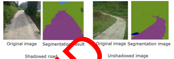
Figure 4. front-end+Large network's image segmentation results for shadowed and unshaded roads