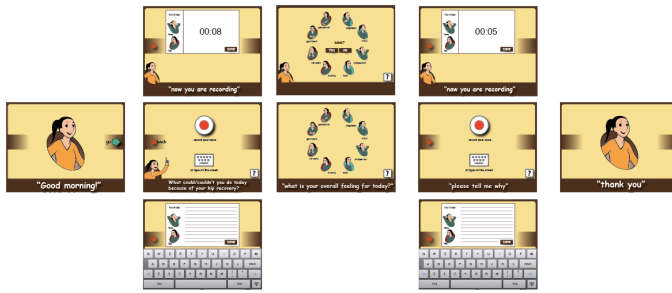
Figure 3. Prompt navigation flow (question 1).

A key finding of the studies based on the ESM system is that THR patients look for ways to share and communicate complaints and questions regarding their recovery. In order to provide this “communication window”, and make stronger the sense that they are heard further by the medical team, an idle state is implemented to allow participants to tell whatever they want to say, whether regarding their daily life, or something they want to ask.