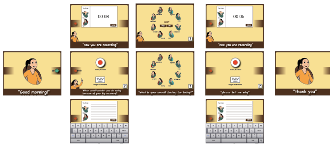
Figure 3. Prompt navigation flow (question 1).

A key finding of the studies based on the ESM system is that THR patients look for ways to share and communicate complaints and questions regarding their recovery. In order to provide this “communication window”, and make stronger the sense that they are heard further by the medical team, an idle state is implemented to allow participants to tell whatever they want to say, whether regarding their daily life, or something they want to ask.