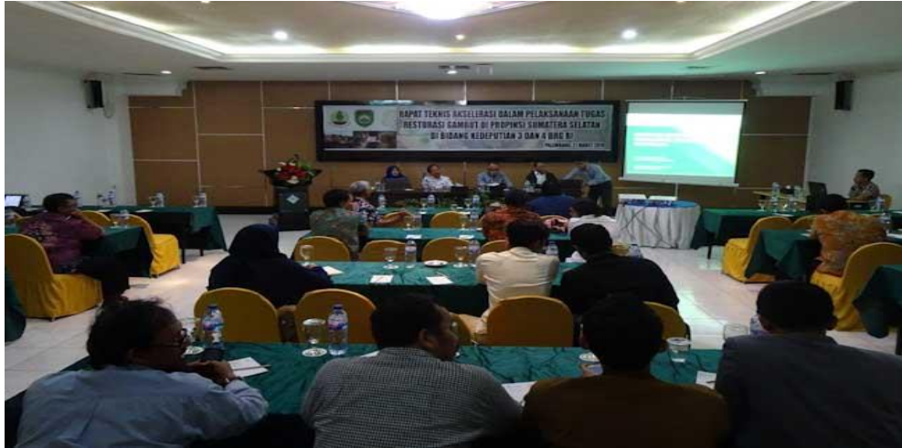
Fig.2. Technical Meeting of Acceleration in the Implementation of Peat Restoration Tasks in the Field of Declines 3 (three) and 4 (four) Peat Restoration Agency (BRG) of Indonesia Republic (RI).