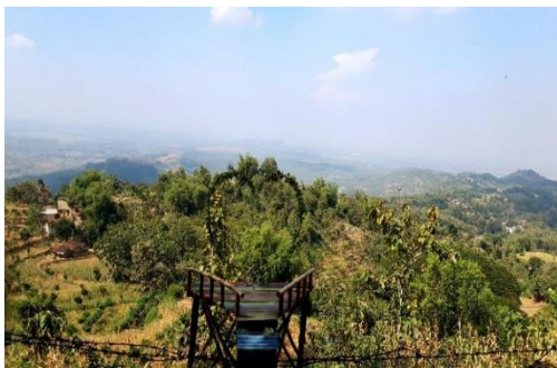
Fig. 9. Wisata Puncak Tapan Andongsari

Next, the village of Wisata Puncak Tapan Andongsari, Grabagan District, Tuban Regency, the tourism village was initiated to optimize the improvement of the village economy by utilizing empty land with all its limitations because the road access to this location is still a lot of damage and limited lighting, but pokdarwis succeeded in changing the top of the village. be an interesting vehicle [13] The following is the documentation of the peak tour of Wisata Puncak Tapan Andongsari: