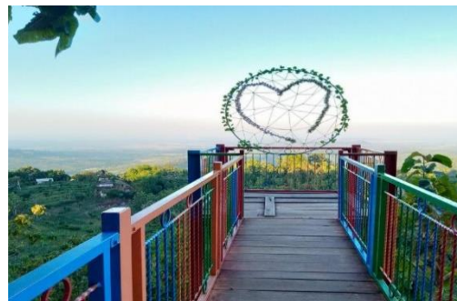
Fig. 10. Spot rides

Based on the exploration of guava tourism village, kutang tourism village and wind tapan tourism village, it can be concluded that: creative tourism as a creative economy that produces “knowledge-based creative activities that combine the needs of tourists by utilizing regional potential by utilizing technology, talent, or skills to produce rides and tourist attractions to experience creative experiences “OECD (2014) [14] Design decisions need to be based on user intentions and experiences and holistic approaches to problems and opportunities; combine imagination, creativity and science for effective innovation; and recognize that stories, especially of the users, are an important tool in the design process [15].