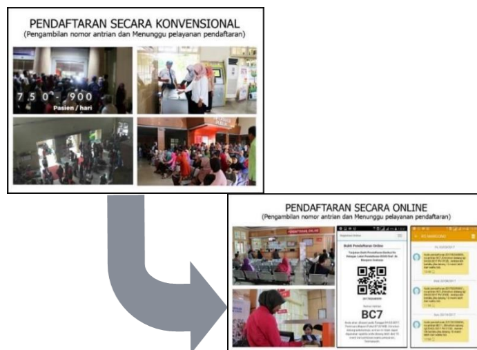
Fig. 1. Overview Before and After Application of Innovation

With the innovation of the G2C system called Penetration Online, it is hoped that it will accelerate the waiting time for registration services which in turn increases customer satisfaction. Registrants no longer need to queue and even scramble to get the smallest queue number.