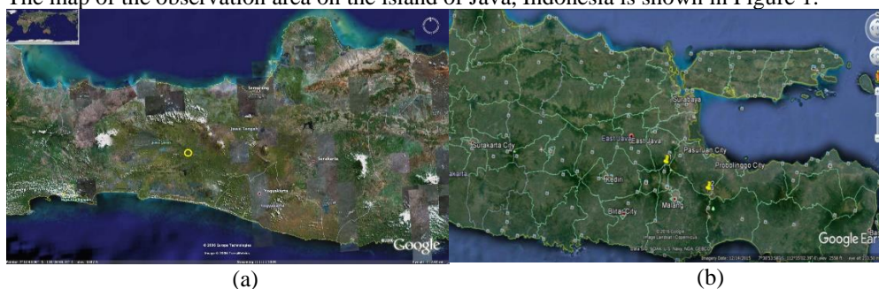
Fig 1. (a) Map of Central Java; (b) Map of East Java (The image marked in yellow shows the location where it was found V. pubescens A. DC., in Batu and Pasuruan).

The exploration in Dieng Plateau, Central Java, and several places in East Java reported that V. pubescens A. DC. can be found in three places: Dieng Plateau, Central Java; Tahura R. Soeryo People's Forest Park Area, Cangar - Batu, East Java; and Bromo, Pasuruan, East Java. The map of the observation area on the island of Java, Indonesia is shown in Figure 1.