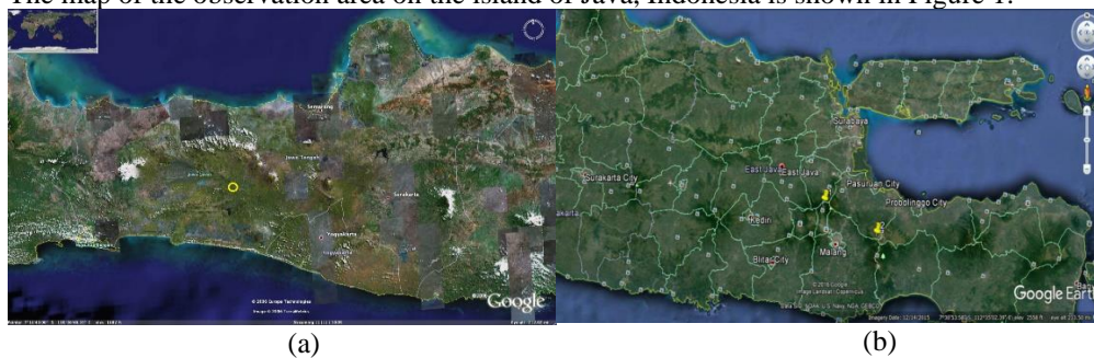
Fig 1. (a) Map of Central Java; (b) Map of East Java (The image marked in yellow shows the location where it was found V. pubescens A. DC., in Batu and Pasuruan).

The exploration in Dieng Plateau, Central Java, and several places in East Java reported that V. pubescens A. DC. can be found in three places: Dieng Plateau, Central Java; Tahura R. Soeryo People's Forest Park Area, Cangar - Batu, East Java; and Bromo, Pasuruan, East Java. The map of the observation area on the island of Java, Indonesia is shown in Figure 1.