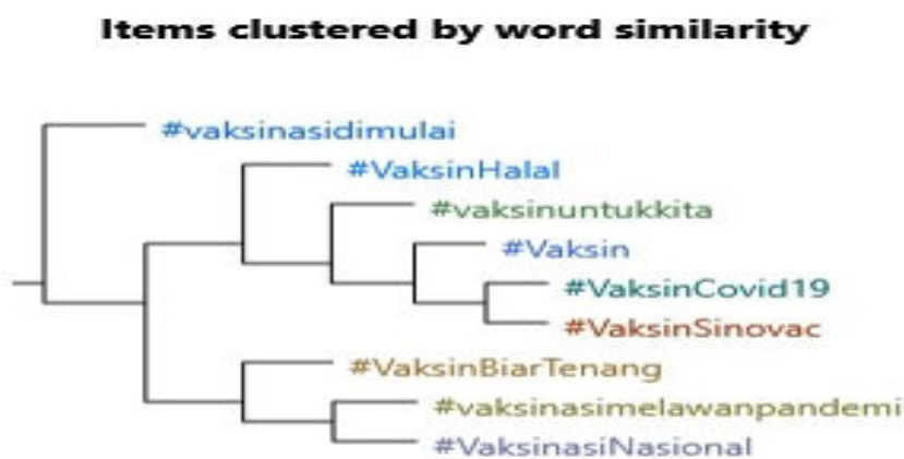
Fig. 2. Social Media Relation about Vaccination

This analysis parts using Cluster analysis to know what kind the social media relation. The analysis using 0,5 lower limit and one upper limit. In this case, social media is used as the platform to know the relation of those hashtags in social media. This analysis using the scale from -1,0, and 1 as a reference in the upper limit and lower limit. the analysis following is down below.