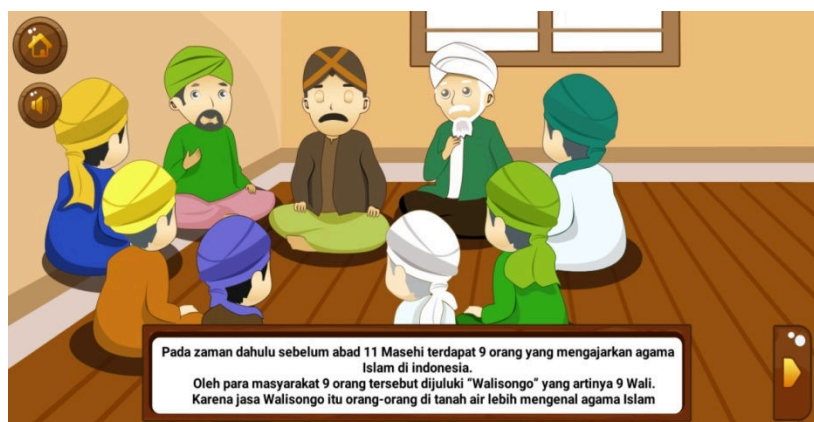
Fig. 3. Illustration of Walisongo's Story in the NU Kids Application

Through an interesting display of the infographics, it is easy for children to get to know the Walisongo characters and the locations of their da'wa distribution areas. The history encyclopedia menu displays not only Walisongo's da'wa journey but chronologically the children will study the history of Islam in Indonesia after the Walisongo period ended which was continued by scholars who came from several regions who later formed a religious organization known as Nahdlatul Ulama (NU). The introduction of the history of Nahdlatul Ulama as the successor to the preaching of Walisongo shows the message of the continuation of religious moderation which is continuously maintained by NU kyai. It is important for children to fully understand the history of the presence of Islam in Indonesia from the Walisongo era to the present, rooted in the values of moderate, tolerant and polite religious teachings. (Dwijayanto, 2017).