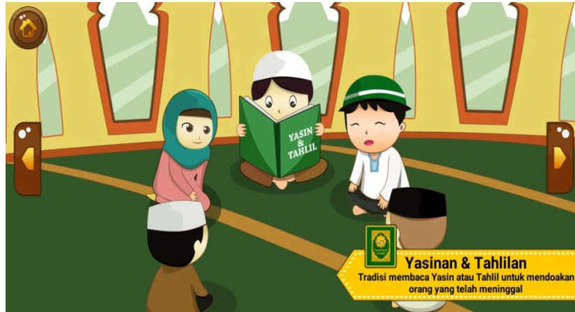
Fig. 6. Illustration of Yasin and Tahlilan in the NU Kids Application