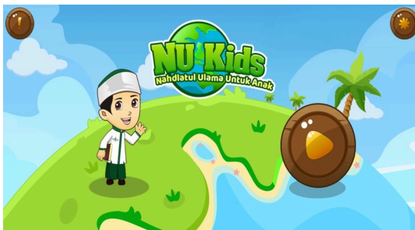
Fig.1. The front Page Display in the NU Kids Application

The front page display of NU Kids shows the religious identity of a child with the Nahdlatul Ulama attribute with a cheerful smile in carrying out religious activities. This gives a message at the beginning to children that The presence of NU Kids application is a representation of moderation symbols which shows the resilience of eastern culture to the culture that comes from the outside, including Islamization of Barbie. (Meneley, 2007).