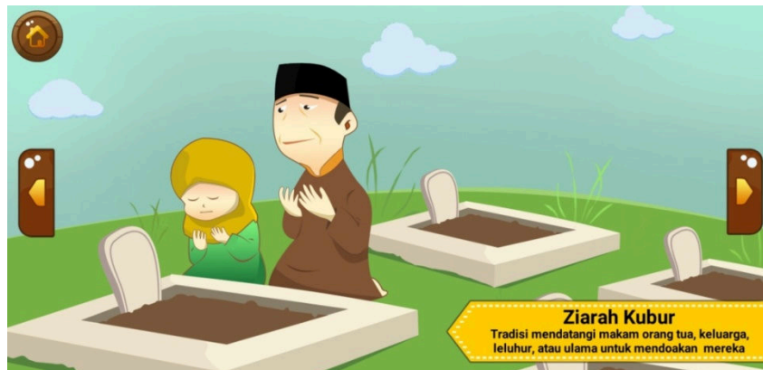
Fig. 5. Illustration of Grave Pilgrimage Traditions in the NU Kids Application

In addition to getting to know NU characters, through the NU Kids application, children can learn about the religious practices that are carried out and preserved by Nahdlatul Ulama. Among them are Yasinan and Tahlilan to pray for people who have died, Istighotsah to ask Allah for help, Maulidan for the anniversary of the birth of the Prophet Muhammad and other traditions. By understanding the traditions and practices of NU, the cultivation of moderate religious values of children will be formed so that it will not be easy to blame local culture which has been covered with religious teachings. The religious identity of the child will be moderately strengthened by the preservation of the Nahdlatul Ulama religious practices.