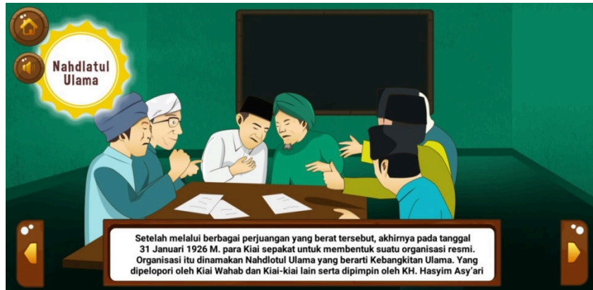
Fig. 4. Illustration of NU Scholars

characters of Nahdlatul Ulama figures. Modeling is the foundation for religious moderation as practiced by the founders of NU from its inception until now. Through biographical content, the internatization of children's moderation characters can be inspired by the founding figures of Nahdlatul Ulama.