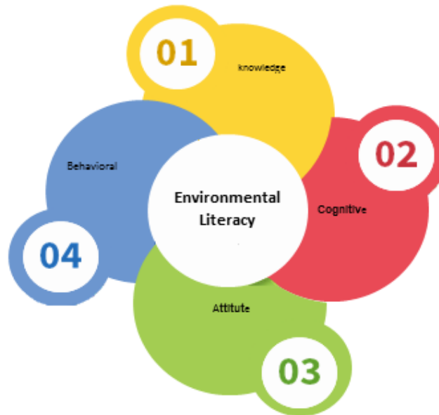
Fig. 2. The Variables of Environmental Literacy (Adopted from Simmons in Negev, M. et al, 2008)

Based on the statistical analysis, the result of students' environmental literacy was revealed. The result was used to identify and compare the score of the samples between students in experimental and control groups before and after the treatment was given. As previously stated, the students' environmental literacy was measured through the questionnaire with Likert Scale from 1 to 5. The result of the analysis is presented in the table below.