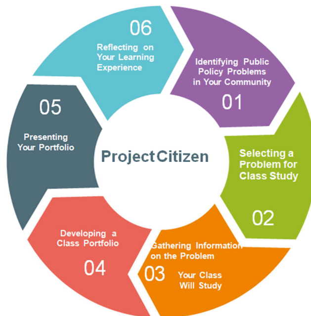
Fig. 1. The Stages of Project Citizen Learning Model

The enhancement of students' environmental literacy was conducted at school by using Project Citizen learning model under one theme namely citizens' rights and responsibilities for environmental conservation. The theme was selected by the students on the first stage that was identifying the problems in their community that they would study. This theme was intended to raise students' awareness towards the fundamental of taking care of the environment to prevent global warming. In the pilot study, this model was performed on the civics subject at Senior High School level.