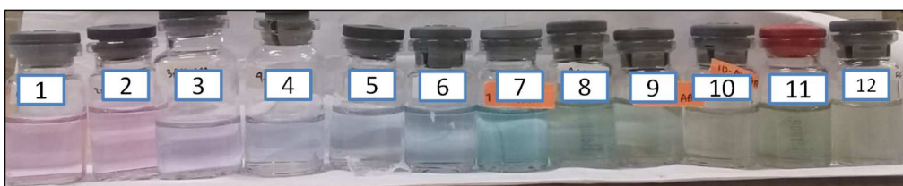
Figure 1. A series of pH 1-12 which has been added to the indicator sample

Butterfly pea flower extract in 70% ethanol and 25% (7: 1) acetic acid at pH 1-12 produces several color variations. The resulting color variations are pink at pH 1-2, purple at pH 3-5, bluish-purple at pH 6, blue at pH 7, bluish-green at pH 8-9, and brownish-green at pH 10-12. This butterfly pea flower extract can be used for acidimetric titration with a pH of 3-5 and can be used for alkalimetric titration with a pH range of 8-9. Testing the absorbance of butterfly pea flower extract at various pH can be seen in Table 1 below