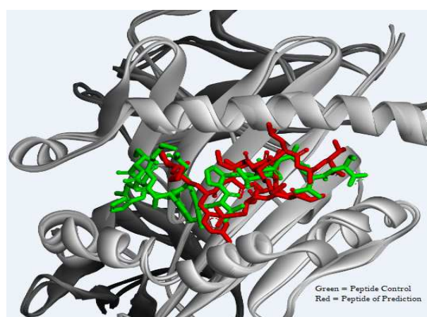
Fig.2. Conformation of MHC I Predicted Molecular Peptide I Results Green = Peptide of Prediction Red = Peptide Control

Based on Table 4, the affinity energy values resulting from the molecular docking process against the peptide of prediction with MHC II are lower (-213.05 Kcal / mol) than the crystal structure affinity energy (1J8H) which is -185.40 Kcal / mol. This value indicates that the interaction in the conformation of the peptide of vaccine candidate-MHC-II is stronger than that of crystal structure conformation. Besides that the peptide of prediction has also located on the same active site as the crystal structure peptide (Figure 2).