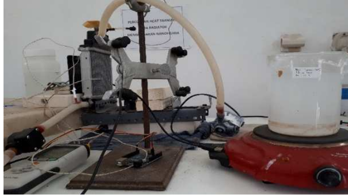
Fig.1. Set of heat transfer experiments