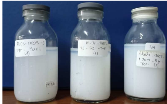
Fig.4. Water – Al 2 O 3 nanofluid with a concentration of 1 g / L, 3 g / L, and 5 g / L

The visual display of the synthesized nanofluid can be seen in Figure 4.