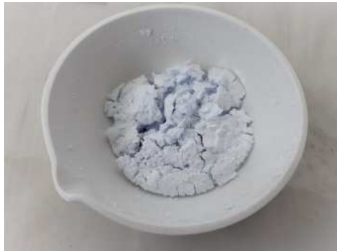
Fig.2. Al 2 O 3 nanoparticles

Al 2 O 3 nanoparticles produced from the solgel synthesis with the addition of citric acid contained in the lemon extract as a chelating agent can be seen in figure 2. The diffraction pattern of Al 2 O 3 nanoparticles calcined at 1100°C for 1 hour is shown in Figure 3. Al 2 O 3 powder consists of two phases namely alpha ( \alpha ) and Gamma ( \gamma ). The crystallite size of the alpha phase nanoparticles is 37 nm and gamma phase nanoparticles is 8 nm which was calculated using the Debye-Scherrer equation [8].