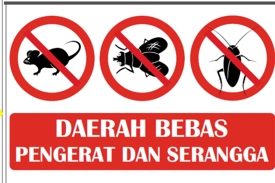
Figure 3. The area free from Rodent and Insect