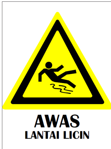
Figure 2. Beware of Slippery Floors