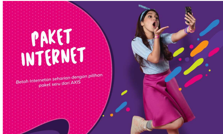
Fig. 1. Example of advertisement provider with a young endorser

Of course it is not without reason to use young endorser, one of which is to hook the market and also to strengthen the character of the product. Based on the latest report of We Are Social , in 2020 it was mentioned that there are 175,4 million internet user in Indonesia. Compared to the previous year, there was an increase of 17% or 25 million internet users in Indonesia. Based on the total Indonesian Population of 272.1 million, it means that 64% or a half of Indonesian population has experienced to cyberspace. The percentage of internet users aged 16 to 64 who owned a device each, they are mobile phone (96%), smartphone (94%), non-smartphone mobile phone (21%), laptop or desktop computer 966&), tables (23%), game consoles (16%) and virtual reality device (5.1%).( https://inet.detik.com/cyberlife/d-4907674/riset-ada-1752-juta-pengguna-internet-diindonesia , 1 Juni 2020)