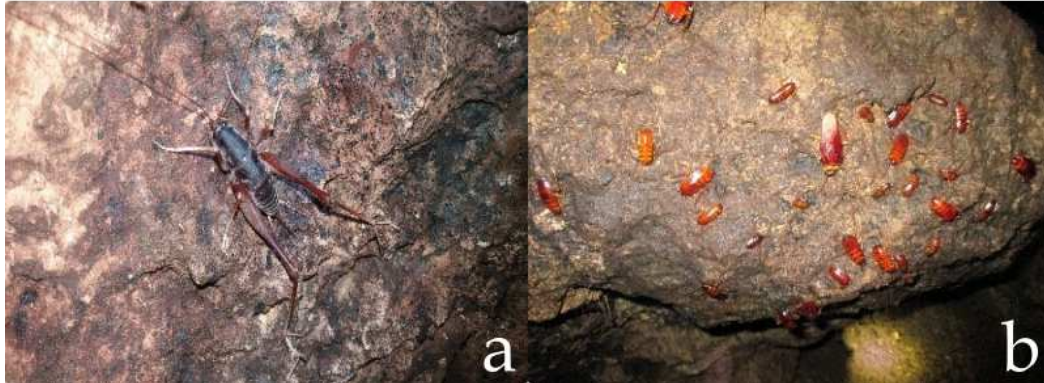
Fig 3. Species with great abundance in dark zone. a) Camel cricket (Rhaphidophoridae), and b) Cockroach (Blattidae).

Evenness value was varying among cave zones. Evenness is negatively correlated with domination. It can be used to explain species domination in a particular community. As seen in Figure 2, It was likely that species domination could occur in every cave zone, even the twilight and dark zones were relatively higher. Low evenness value of entrance zone occurred in Sarongge and Liang Seungit, these sites were predominated by ant populations (Subfamily: Ponerinae and Myrmicinae). For twilight zone, low evenness values were found in Sarongge and Liang Seungit. A capsid bug (Hemiptera: Miridae) and a cockroach (Blaberidae) were dominating these sites respectively. Meanwhile, the dark zones in all caves were dominated mainly by camel cricket (Rhaphidophoridae), also by two different cockroaches, Blattidae in Sarongge and Blaberidae in Liang Seungit. Alongside camel cricket, cockroach is also well known as abundant group of Insecta in caves[22]. Furthermore, several species were also reported as troglodite. For instance, the giant cave cockroach from east Borneo Miroblata bairi [23].