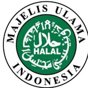
Fig.1. Logo of Label Halal MUI

Halal label is the granting of halal marks or written evidence as a guarantee of halal products with Halal writing in Arabic letters, other letters and motor codes from the Minister issued on the basis of halal inspection from halal inspection institutions established by MUI, halal fatwas from MUI, halal certificates from MUI as a valid guarantee that the product referred to is halal is consumed and used by the community in accordance with Islamic regulations [2].