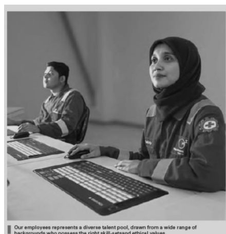
Fig. 2. Diverse Talent

The narrative accounting disclosures explored and investigated on its intertextually basically is limited to the level of the disclosures presented by MedcoEnergy. Therefore, further exploration revealed an image that was stated to represent diverse talents. The figure shows a female working in hijab, which considered to be not conventional in MedcoEnergy. The reason is that most of MedcoEnergy workers are male, as shown in Figure 2 and Figure 3 .