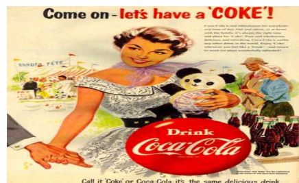
Fig. 1. Conceptual Meaning

The phrase analysis of 'Come on - let's have a' COKE'!' in the above brochure, contains a denotative meaning which emphasizes the logical meaning to invite to enjoy a fresh drink. In the first sentence which stated 'coke' or coca cola, has the same intention which expresses 'delicious drink', contains a meaning that emphasizes the equation that either 'coke' or 'coca cola' is a soft drink.