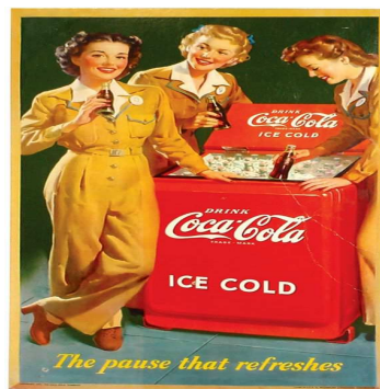
Fig. 3. Connotative Meaning

The phrase ' the pause that refreshes ' contains connotative meaning because in the brochure there are pictures of three women who express their happy moments while relaxing or taking a break, so the brochure display here reflects the meaning of conditions and situations in the female character. In the brochure, there is the phrase ' the pause that refreshes ' this means that the picture and sentence in this brochure, invites us how to feel the freshness of carbonated drinks without any limits or pauses, so the freshness at all times.