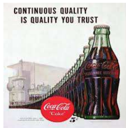
Fig. 2. Conceptual Meaning

The phrase on the second brochure 'continuous quality is quality you trust'. The word 'quality' affirms the consumer's confidence in this carbonated soft drink product to always be