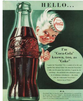
Fig. 8. Affective Meaning

For the phrase 'Hello..I'm 'Coca-cola' 'known, too, as' 'Coke' explains the expression of his personal feelings from the author as well, the author also introduces the product through this brochure. Therefore, for those who read the brochure there is a sense of wanting to know the meaning of the sentence, here there is a difference in the word intonation. The word 'coca cola' is better understood than the 'coke', but both actually mean soft drinks. In this brochure, there is a sentence 'Hello. I'm Coca-Cola' is also known ', too, as' 'coke', which means that this product introduces itself with a simple name in the simpler mention of 'coke'. Like the words 'coca cola' and 'coke' in the brochure, this means the same but the rate of mention is different, westerners there call 'coke' more often, while the eastern ones are more often called 'coca cola' drinks or soft drinks.