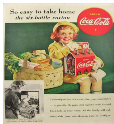
Fig. 4. Connotative Meaning