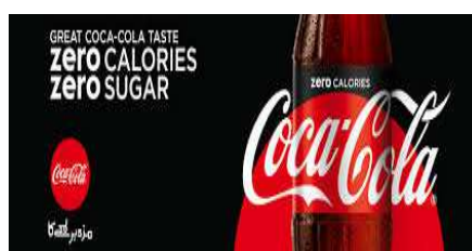
Fig. 11. Collocative Meaning

The sentence in the coca cola brochure ' Great coca cola taste ' means this product has a feeling that need not be doubted, the sweet and fresh taste is the mainstay. In this sentence, there is a collocative meaning that is meant to occur together with certain words. In this brochure there is a sentence that the mention of one word ' Zero calories, Zero sugar ' means that both for those who do not like sweet, good for those who run a diet program, all people can consume, the taste is also very refreshing, as a very thirst reliever.