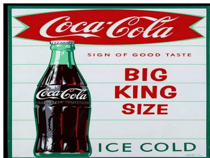
Fig. 14. Thematic Meaning

The next brochure in the phrase ' sign of good taste ' in this thematic meaning refers to what the speaker or the author communicates in the corresponding message to focus on emphasis. Therefore, the sentence above is part of a sentence that can be used as subject, object, or complement to indicate conformity to a sentence. In this brochure, there is the phrase ' sign of good taste ' which the meaning of this sentence gives a different and tasty taste because the quality of this product has been worldwide. Many people like the taste and for the category of soft drinks there are four variants that are produced in addition to the sponge coca cola, and the fruit flavour is two categories, strawberries and oranges, so the taste can be chosen according to the customer's desires.