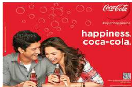
Fig. 5. Social Meaning

A phrase 'happiness coca cola' means being happy with coca cola, because it means that coca cola always brings happiness for anyone who drinks it and in any situation, the social meaning in the sentence in this brochure refers to the existence of some words or words as dialects. The sentence in this brochure also invites the social environment to always be happy. In the brochure, there is the phrase 'happiness of coca cola' , the meaning of the sentence in this brochure is that there is a sense of happiness when it is drunk, because it feels so refreshing when the weather is very suitable for consumption, and when drinking it other than fresh feeling and feeling of happiness that can be felt to eliminate adamant thirst.