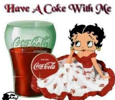
Fig. 10. Reflected Meaning

The second brochure with the phrase ' have a coke with me ' sounds strange, for the use of the word 'have' in this sentence from the word it has one meaning but its meaning may have many other significance and understandings, and it depends on the use of the word 'have' for the past, present or future because reflective meaning is a phenomenon of a word or phrase that is linked to more than one meaning or meanings. The brochure has the phrase ' have a coke with me ' this means enjoying this soft drink with me, so it can be enjoyed together with anyone and the other purpose is also the word 'have' means to have a sense of freshness with me. It was concluded that the meaning of the sentence above is a feeling of togetherness that is very good among others.