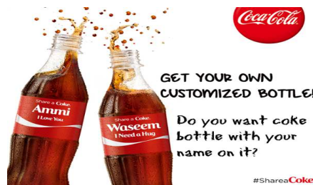
Fig. 9. Reflected Meaning

The phrase 'Get your own customized bottle' in this reflective meaning is a phenomenon where one word or phrase is associated with more than one meaning or meaning. The word 'bottle' in the sentence above shows that the word can mean a lot depending on the order of sentences and the purpose of the sentence. A word can also form part of our response to another sense. In this brochure the phrase 'do you want to coke bottle with your name on it?' this means that the innovation made by this product is very good, can include the name of the consumer on the bottle packaging. This is a surefire way to attract consumers because of more and more people like this carbonated beverage.