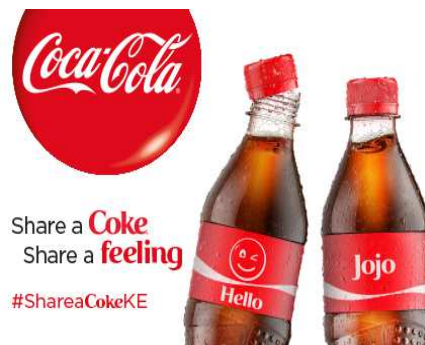
Fig. 12. Collocative Meaning

The phrase of the brochure ' Share Coke .... Share Feeling ' means to promote its products use the word ' share ' with the intention of sharing to anyone, whether sharing a drink or sharing the taste, so the collocative meaning here is the meaning communicated through the words that go along with other words. In the brochure, there are the words ' coke ' and ' feeling ' which means that there is a sense that can be shared with us drinking this soft drink. Sharing joy, happy with friends, friends or even partners, the meaning of collocative is very appropriate for the sentence in the brochure, because there is one concurrent word in one sense.