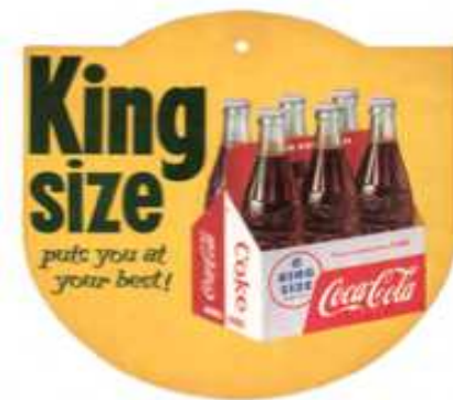
Fig. 13. Thematic Meaning

In this brochure, there is the phrase ' King Size ... Puts you at your best '. The meaning of the sentence is this coca cola product has an appropriate size to enthusiasts of soft drinks because coca cola products are produced for bottle packaging that has several sizes, so it varies in size options. Thus, the thematic meaning is contained in the sentence, because what is communicated in the manner in which the message is governed in terms of order and emphasis.